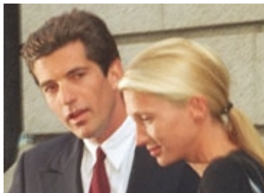
John F. Kennedy Jr

Potential Candidate for Senator from New York.