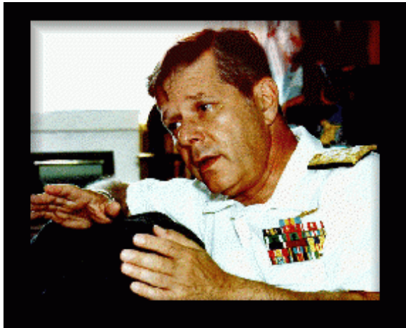
Admiral Jeremy Boorda

The “suicide” note, (leaked despite official efforts to keep it from view) has since been revealed to be a forgery.