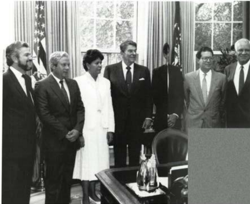
The Oval Office, August 5, 1987. A gathering of Nicaraguan resistance leaders to mark yet another CIA-inspired merger of the Contra armies from the FDN to the United Nicaraguan Opposition (UNO). Second from left is Aristides Sanchez. Adolfo Calero is on the far right.