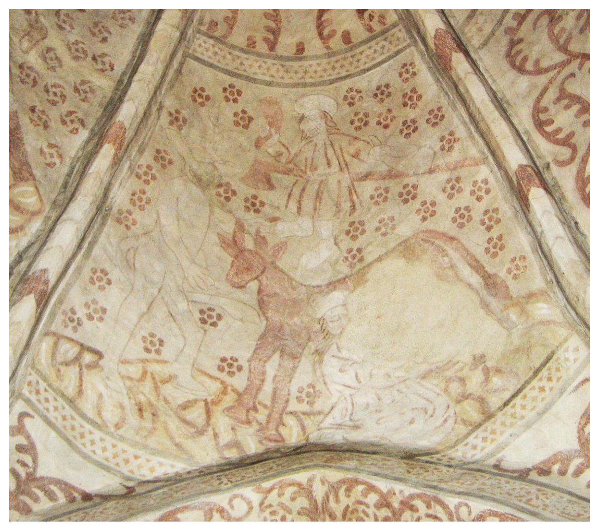
Fig. 1. Espoo Church, milking scene with a Journey to Blåkulla.

The interior walls of the church were decorated with consecration crosses during the construction phase in the late fifteenth century. The walls and vaults were more extensively painted presumably after the vaulting of the church was finished in the 1510s.<sup>20</sup> There is no information concerning the group of painters who were responsible for the work but based on stylistic similarities, the group seemed to have executed wall paintings in other early sixteenth-century churches of Southern Finland, in Siuntio, Inkoo and in the Franciscan convent church in Rauma, the latter being situated in the south-west coast of Finland. The painters