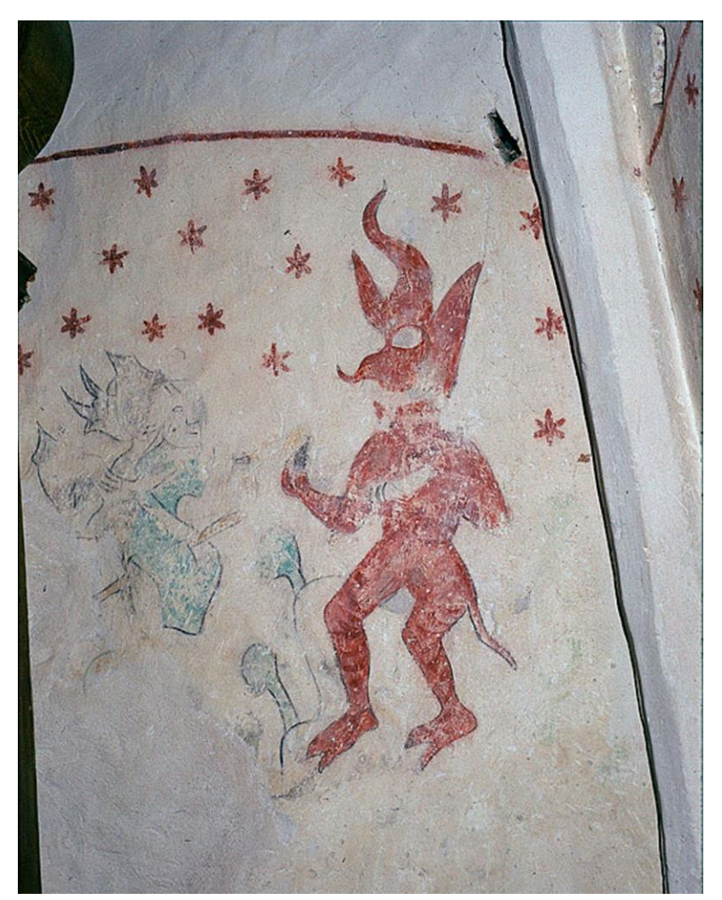
Fig. 5. Porch of Kalanti Church, Journey to Blåkulla.

In a rural context, theft would have signified the breaching of social codes. A peasant household was regarded as a unit in which the work done benefited the common good. In such a context, the interference of something deemed malevolent might have had serious consequences.<sup>31</sup> The demonic being in the images of milking and churching brings an ominous aspect to the tasks which is underlined by the paradigmatic relationship between the women and demons. Yet another supernatural element is implied in the milking scene by placing a woman with a broom above it, as if flying. In Nordic medieval wall paintings motifs representing women flying on brooms, sometimes with demons, usually represent the myth of the 'Journey to Blåkulla'. In another late fifteenth-century representation of the Blåkulla in the porch of Kalanti church, a woman is seen