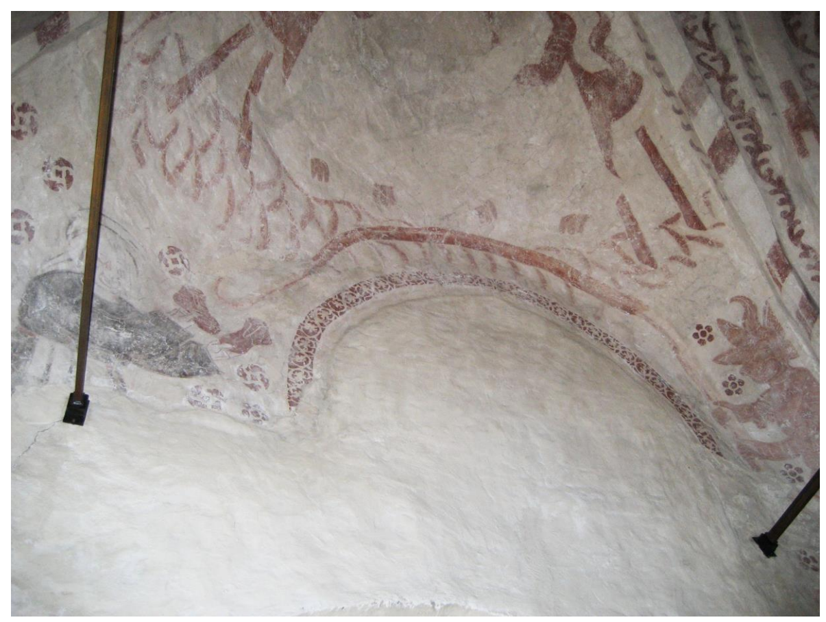
Fig. 8. Siuntio Church, Skoella and a devil.

Skoella is thus a representation of a woman so frightful that even the devil himself was afraid of her. She was 'the woman who was worse than the devil'. The motif is thus connected to the biblical topos of the mythical evilness of women, the evilness being a quality in women that stretched again back to Eve. Skoella can also be understood as a vetula , the figure of a tale-telling bawd usually portrayed as an elderly woman. The context of the actions of a vetula is often comic in essence, yet she tends to be represented in a negative manner. In the Skoella story the old woman is the transmitter of the poisonous attempts of the devil; she is the devil's proxy. Thus the image also relates to attitudes directed to women and especially to old women. According to Jan Ziolkovski, the distrust of men towards older women in part rested on lack of control: older women had much more freedom to move about than younger women. They could for example spread news which other women also relied on the news carried by the