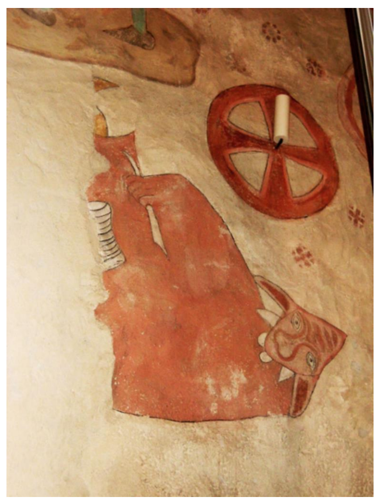
Fig. 15. Lohja Church, Tutivillus.

Although the Warning to Gossips uses a gendered visual strategy by specifying the gossipers as women, it easily could have worked as a warning for gossipers of both sexes as female speech could have been regarded as a threat to both men and women. Si In Siuntio, Rymättylä and Hattula the demons have been portrayed with women. Whether the motif was specifically targeted at women is more difficult to conclude. In Hattula the painting is in the north side of the nave. The placement of the Warning to Gossips in Siuntio might seem to suggest how men and women were placed during mass as the female gossipers have been painted on the north aisle and the male gossipers on the south side of the nave. There is no information about the seating order of the parochial churches in medieval Finland, although conventionally the north side has been associated