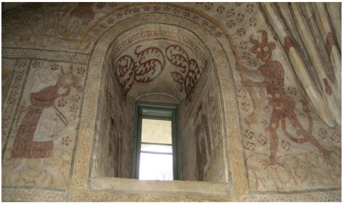
Fig. 7. Espoo church, Skoella.

role of the female witch was therefore something very opposite to the stereotypical good wife, a role women were assumed to follow. Louise Jackson has stated that the witch used her own power and sexuality independently and free form male control and therefore did not follow the traditional roles for women.<sup>65</sup> The role of a 'witch' was part of an identity construction, an image against which women were persuaded to reflect and judge their own behaviours.