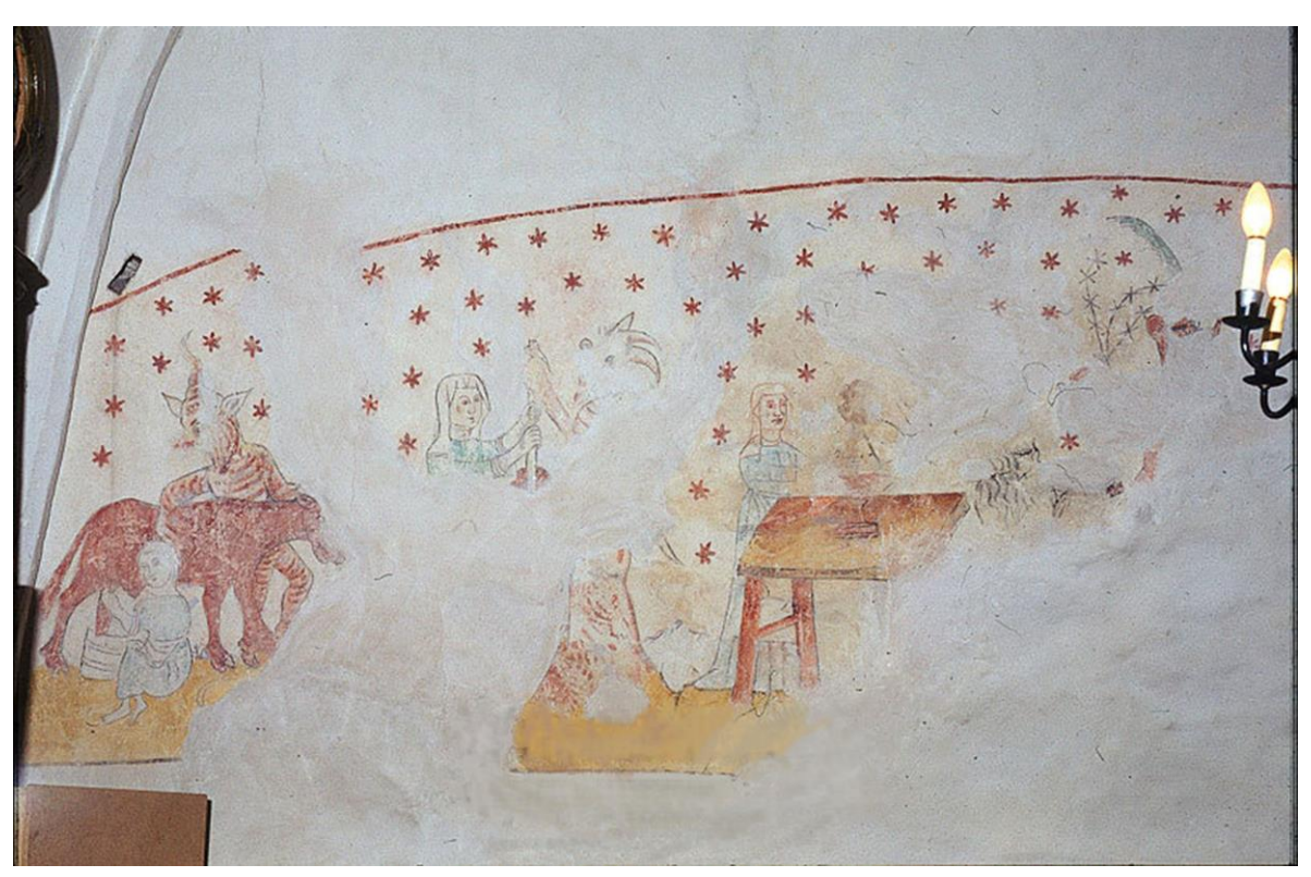
Fig. 4. Porch of Kalanti Church, milking and churning.

para.<sup>24</sup> It is often unspecified in appearance but in both literal and visual rendering it tends to be regarded as a hare, or a cat. In another early sixteenth-century painting in Lohja church, the para is seen drinking from a bowl in the scene of milking (Fig. 4).