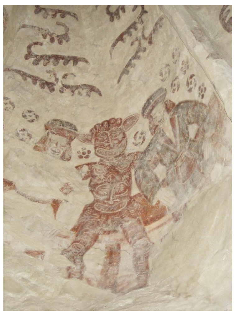
Fig. 12. Siuntio Church, Warning to Gossips.

In Espoo the motif clearly relates to the recording narrative but instead of just one demon there are three of them. This is a typical feature in all the other wall paintings in medieval Finland representing the same story. According to Margaret Jennings, the story has been highly susceptible to agglutination and the number of characters increased over time.<sup>82</sup> A famous example of several demons writing on parchment is in St. George Church in Reichenau (Germany) where the number of parchment-stretching demons is four and Tutivillus is the fifth demon actually writing on the parchment.