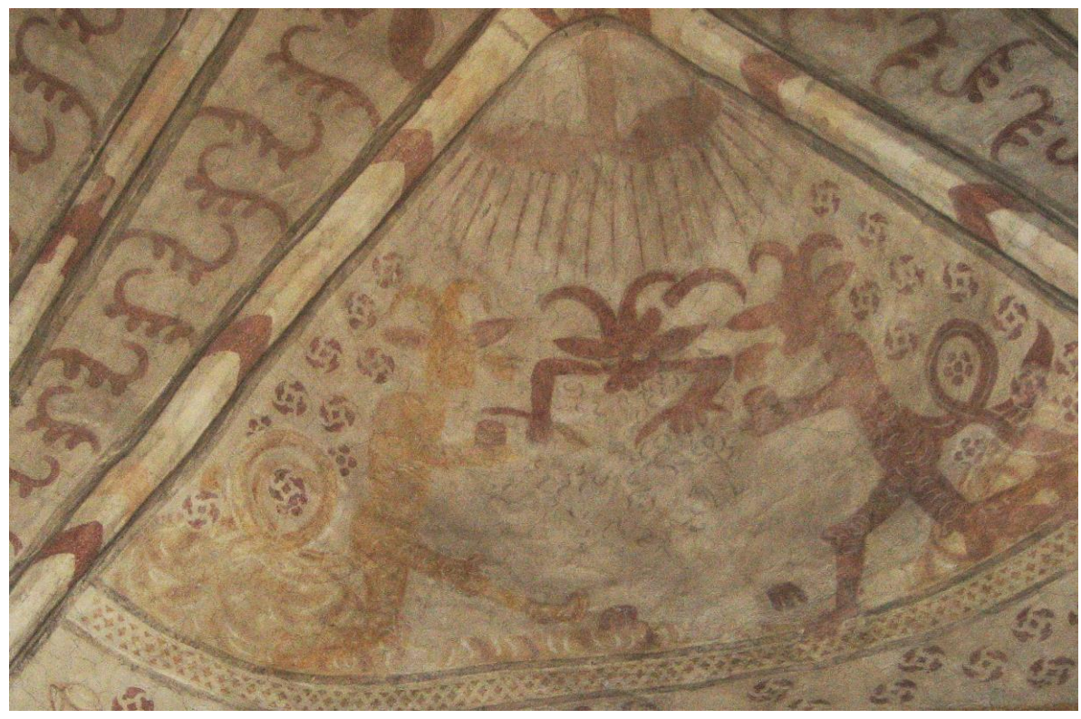
Fig. 9. Espoo Church, Tutivillus.

older women but men could see them merely carrying scandal and gossip. Thus, older women had power in terms of speech and mobility.<sup>71</sup> However, the Skoella story does not represent her mobility and speech in a positive way but in negative, maleficent manner.