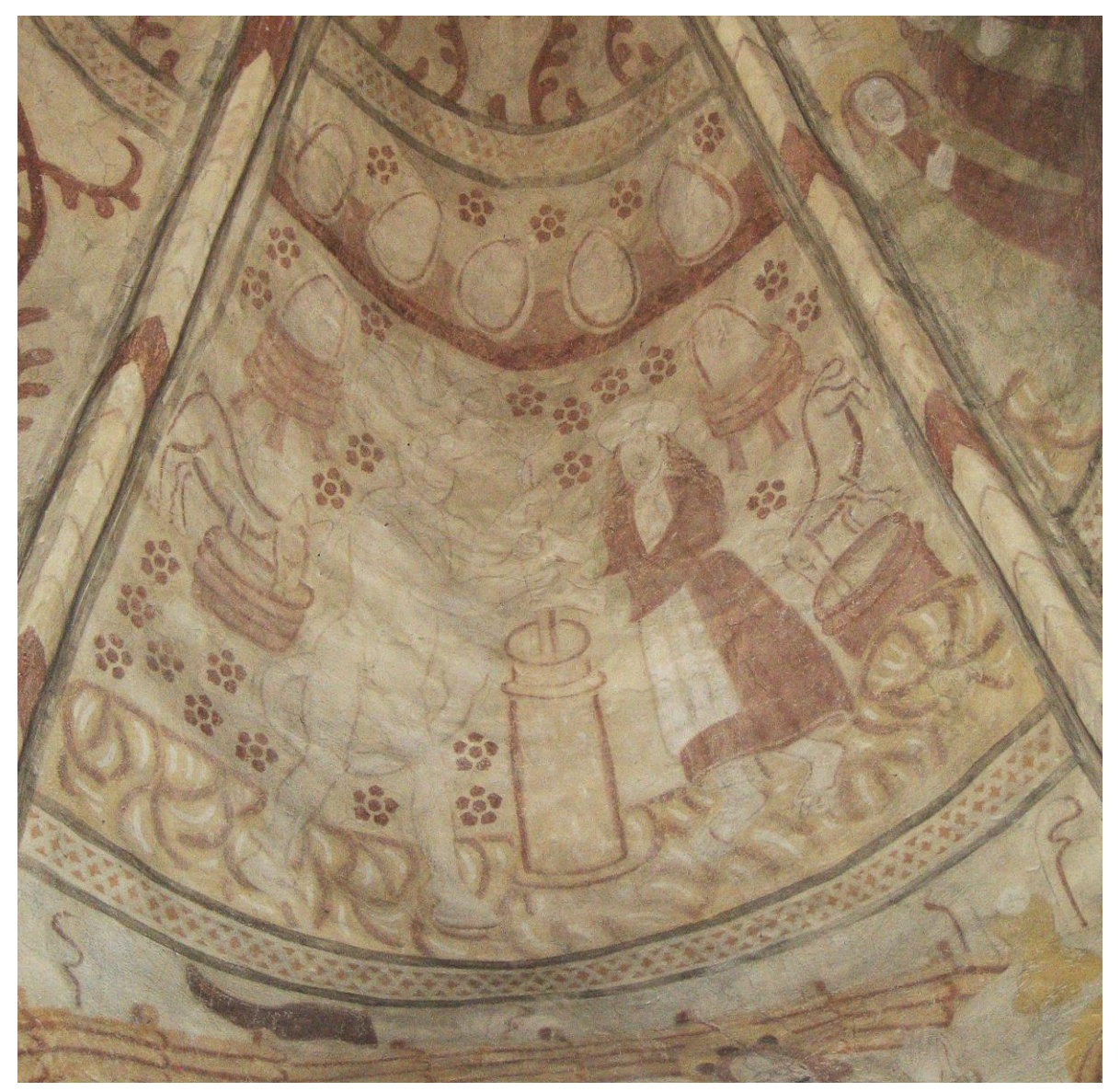
Fig. 2. Espoo Church, churning scene.

were most likely a group of so-called professional painters who had some form of formal and practical training in painting. The evaluation of the paintings in Espoo in their medieval state is challenging since during the early nineteenth-century alteration work of the church, six central vaults were taken down. The existing paintings are only visible in the walls and vaults of the eastern and western part of the medieval nave.