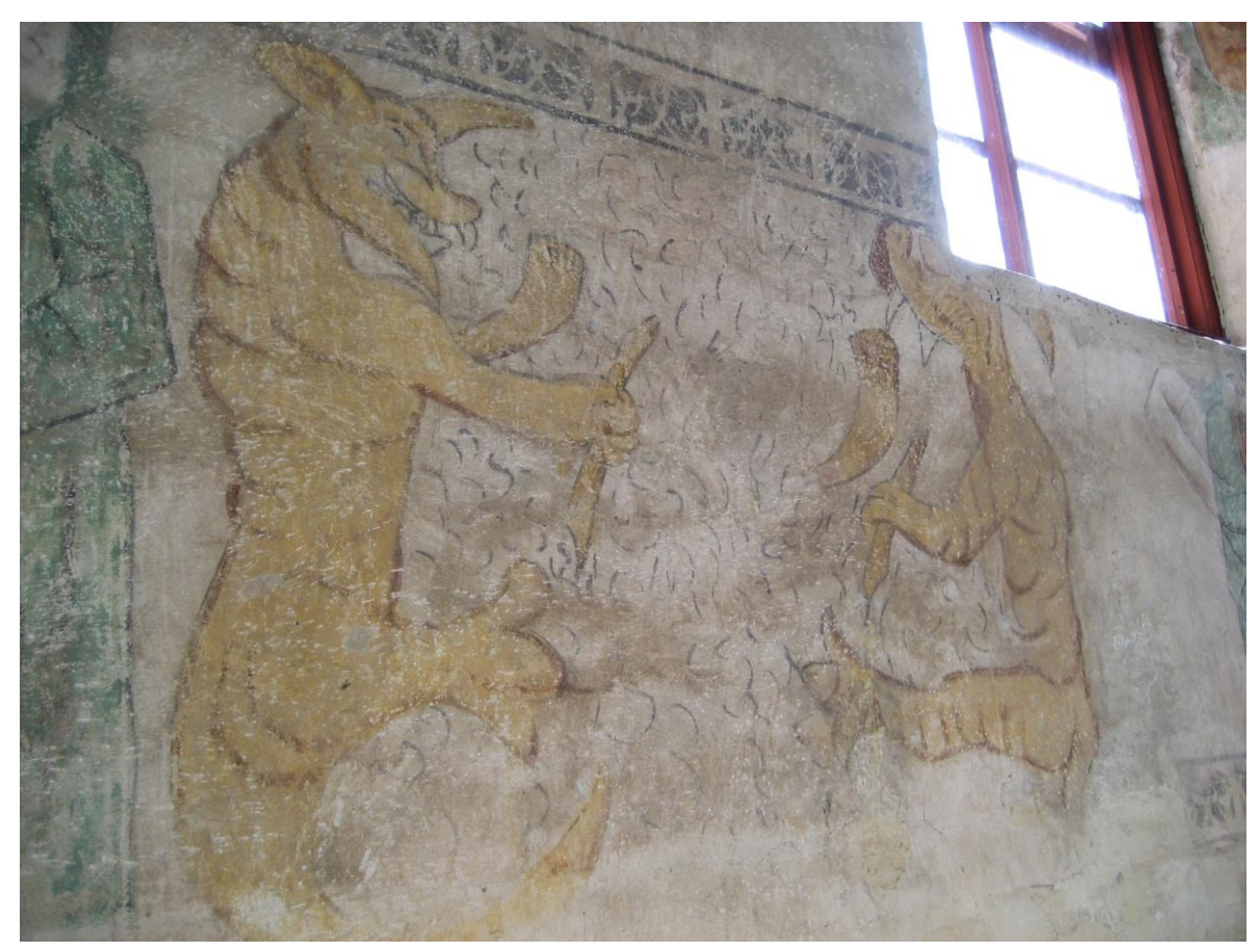
Fig. 16. Hattula Church, Tutivillus.

with women.<sup>94</sup> The Danish evidence suggests that men and women were seated separately, women on the north and men on the south.<sup>95</sup> The placement of the motif is in most cases in the western part of the nave, that is, at the back of the nave. But in Rymättylä the painting is the porch and thus it was available for observation mainly before and after mass.