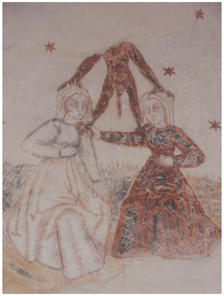
Fig. 13. The porch of Rymättylä Church, Warning to Gossips.

Thus there seems to be two variations of the idea of idle and secular talk in the church with slightly different emphases. The demon with women (and in one occasion with men) can be connected to the motif of Warning to Gossips . Idle talk during mass was a concern for the church as talking and mumbling parishioners disturbed and interrupted the officiating priest. It was a question of power since the church aimed specifically to control people through mass, liturgy and sermon.<sup>86</sup> Gossiping in the church during Mass diverted people from the holy words and from personal contemplation. Idle speech was thus regarded as a form of spiritual laziness.