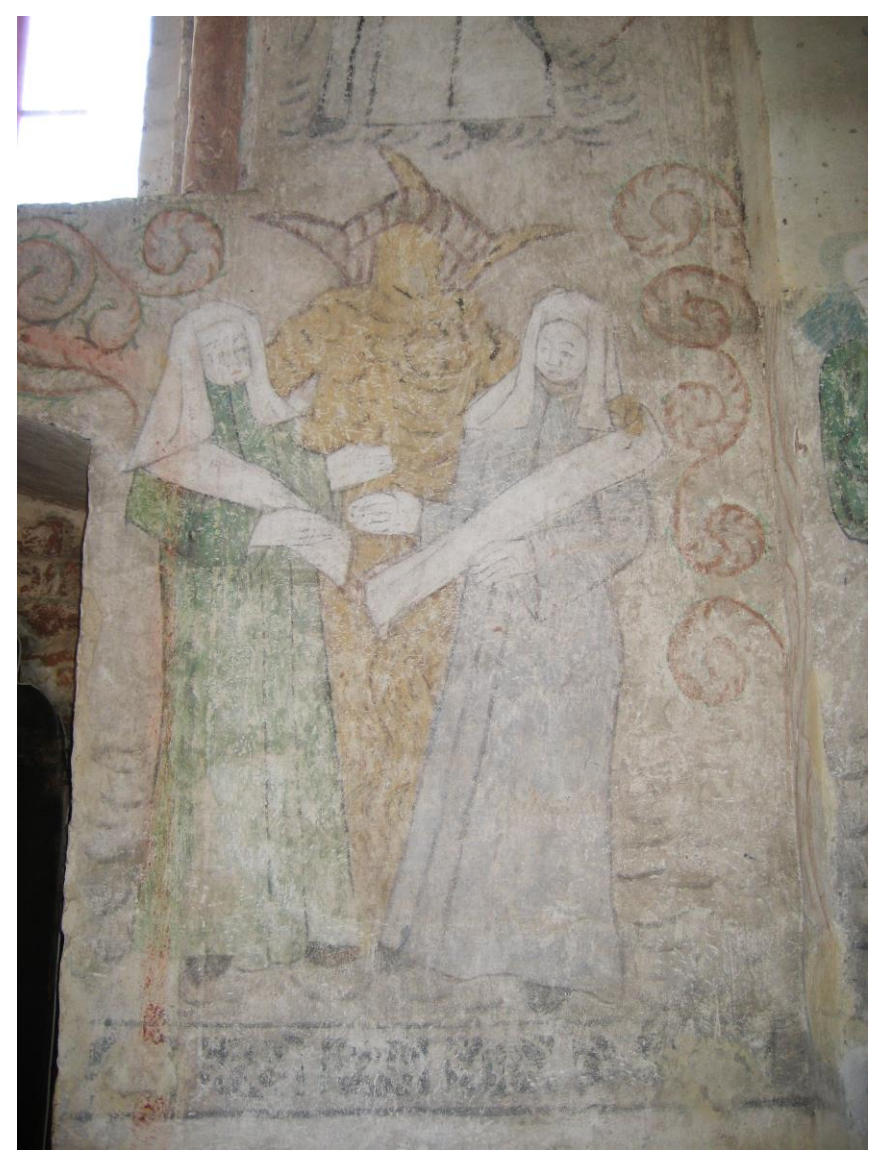
Fig. 14. Hattula church, Warning to Gossips.

The Warning to Gossips , however, portrays the gossipers mainly as women as does the textual narrative. Such a clear gendering refers to the age-old concept of the susceptibility of women to gossiping. Female virtue was equated with silence or modest and gentle speech in sermons and literature.<sup>87</sup> It was assumed that if a woman was free with her speech then she must have been free with her sexuality too. A talkative woman was therefore an unchaste woman. According to Margaret Miles women's mouths, tongues and speech have been frequently correlated with the vagina – open when they should be closed, causing the ruin of all they tempt or slander. The association of garrulousness with wantonness