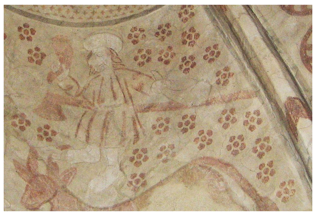
Fig. 3. Espoo Church, Journey to Blåkulla.

depicted in the milking scene seems to be pointing with his left hand at the woman (Fig. 1, 3). On the south side of the church, the milking scene continues with a scene representing a demon assisting women in churning the butter (Fig. 2). Here, the central motif is the churn. On its right side a bare-footed woman with long hair, a headdress, a long skirt and an apron, is seen churning, and on the left side a smiling demon with horns, hoofs and a tail is assisting the woman by holding the plunger. The large butter tops rest on a wooden tripod container and five more butter tops are seen above the woman and the demon. There are also two small animals drinking from or spitting to bowls.