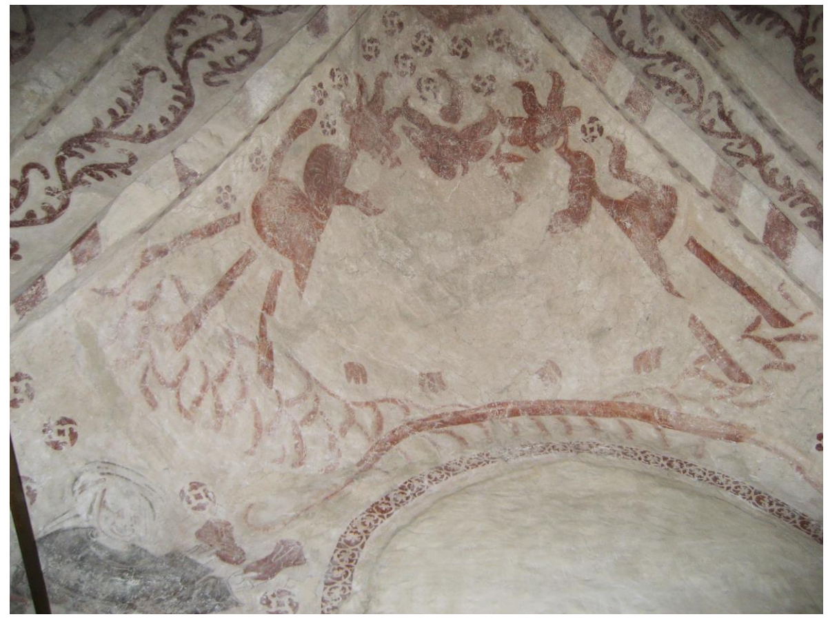
Fig. 10. Siuntio Church, Tutivillus.

The name Tutivillus or Titivillus first appears in Tractatus de Penitentia by thirteenth-century Franciscan theologian Johannes Guallensis (John of Wales) from c. 1285, although it depends on an earlier source.<sup>79</sup> The Tutivillus-story has two different narrative traditions of which one was devoted to the recording demon and the other to the sack-carrying demon who collects words skipped by clerics. In Finnish wall paintings the demon is usually depicted as writing down words on a parchment. The sack-carrying demon as a distinct character makes his first appearance in Jacobus de Voragine's Sermones Vulgares , a collection of sermons and exempla , and subsequently appears in a number of texts and geographical locations throughout the Middle Ages. In the story, Jacobus recounts a narrative about a 'fiend' who carries a heavy sack filled with verses