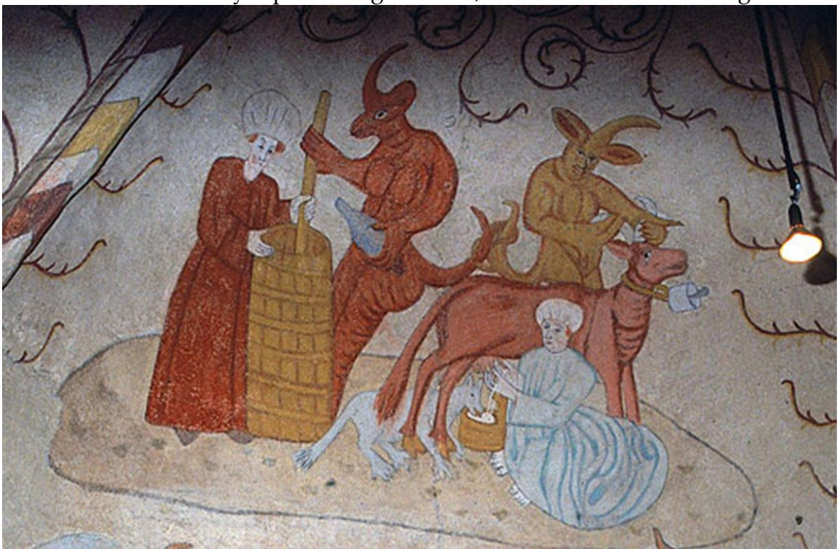
Fig. 6. Lohja Church, milking and churning.

riding on the broom with a demon (Fig. 5). Another, large demon standing on a mountain undoubtedly representing Blåkulla, is also shown in the image.