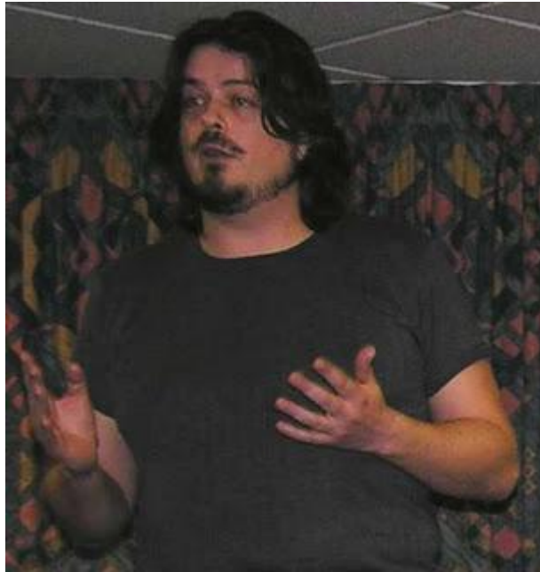
'Former' MI5 agent David Shayler.